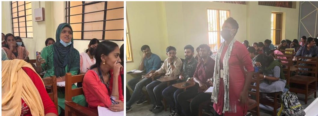
Fig 1.8,1.9 : Interactive sessions

The entire session was much appreciated on it's relevance and accuracy by both teachers and students alike. Not only did it became a stage for knowledge transfer, but also for doubt clarification. The participants infact demanded a longer session, or another indetail session of the same genre. Scholars were all well informed and ready to conscientize the crowd on some valid problems the society face today and how they are tackled constitutionally. Such programs are expected in the future aswell.